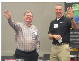
2017 Exhibitors Reception

Member registration is $25 per person, and exhibitors pay $350 for the member rate (package includes