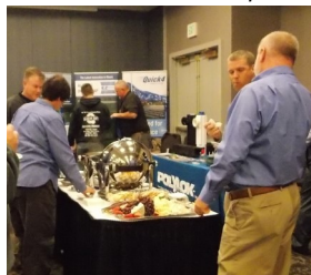
table booth space, full-page color ad in the conference guide, and 2 attendee registrations). Non-member registration is $100 per person and $600 for the exhibitor package. Registration fees listed are for check payment. PayPal & credit card payments can be made online at http://www.ohioprecast.org/members.html (processing fee added). Registration forms are available on the Events page.

The OPCA guest room rate is $99 through February 19th. Note: lower rates may be available to IHG reward members. Conference registration deadline is March 9.