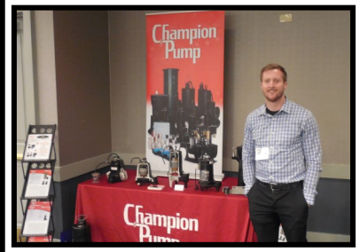
More scenes from 2016