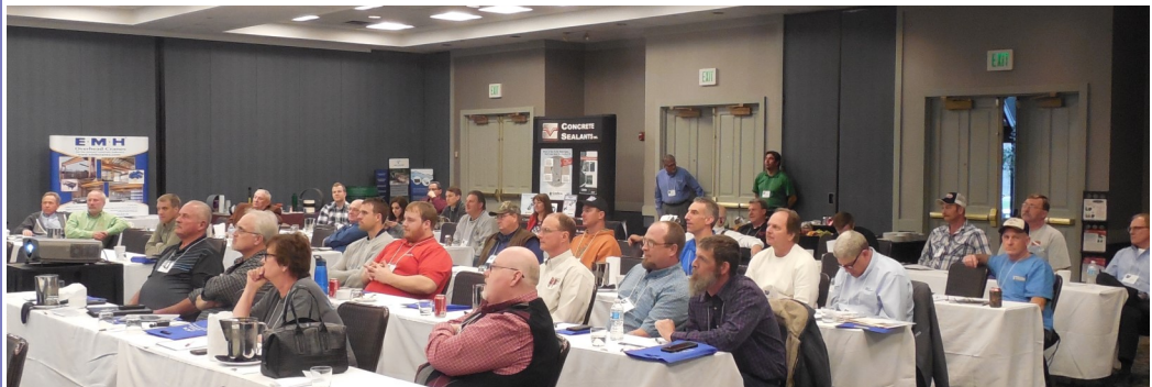
2016 Annual Conference