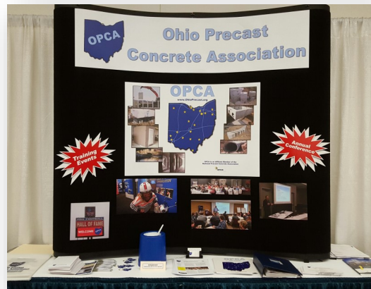
OPCA Booth at The Precast Show

The Precast Show took place in Ohio this year, at the Huntington Cleveland Convention Center March 2-4. The National Precast Concrete Association invited us to represent Ohio as the host-state affiliate. We were provided exhibit space and met many wonderful people representing the industry in various roles from across the U.S., as well as Canada, Great Britain, Ireland and